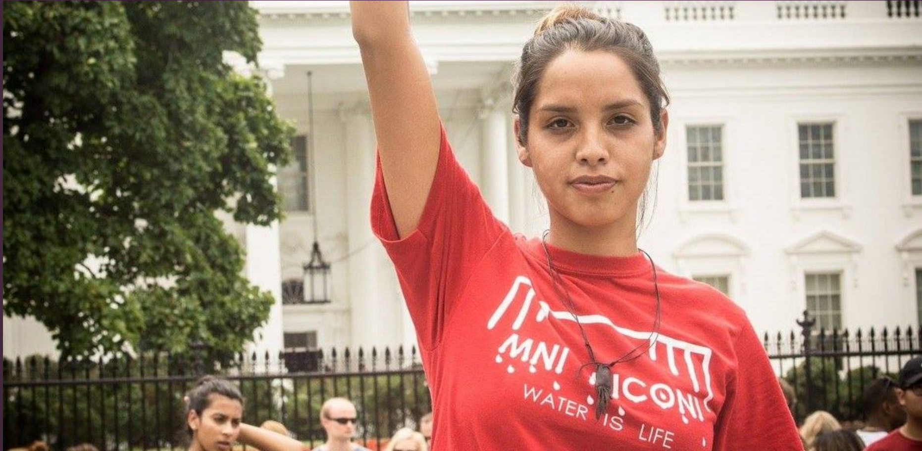
Image found on https://cdn2.hubspot.net/hubfs/1965224/Blog/native_hope_bobbi_jean_three_legs1-1.jpg