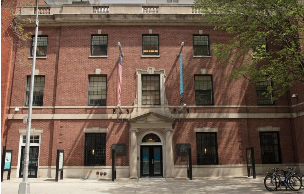
Venue (top): Center for Jewish History, 15 West 16th Street Hotel: Walker Hotel Greenwich Village, 52 West 13th Street Both located near Union Square Station in a highly walkable area