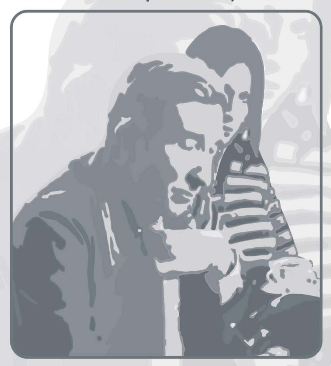
University of Belgrade, Faculty of Philology Serbia - June 1-5, 2018